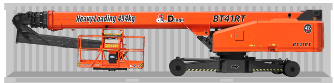
Standard Container Transport