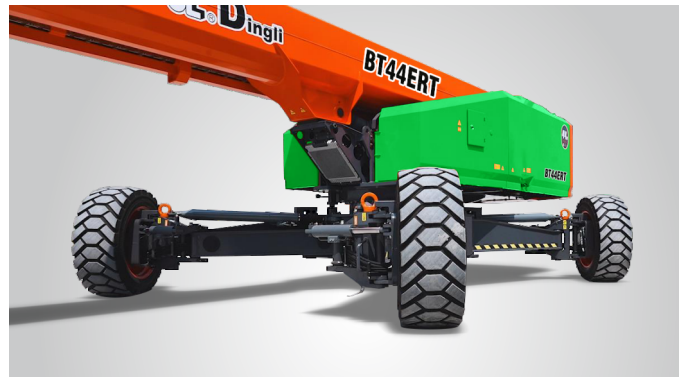
Brand New One-Key In-Situ Axle Expansion Technology Global Patent Protection